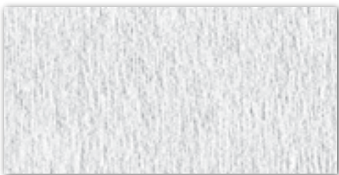
Toptex painter's glass fibre fleece raw ZR07 Toptex painter's glass fibre fleece pigmented ZP07