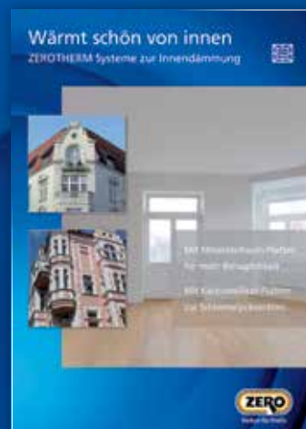
The ZERO THERM System for efficient interior wall insulation