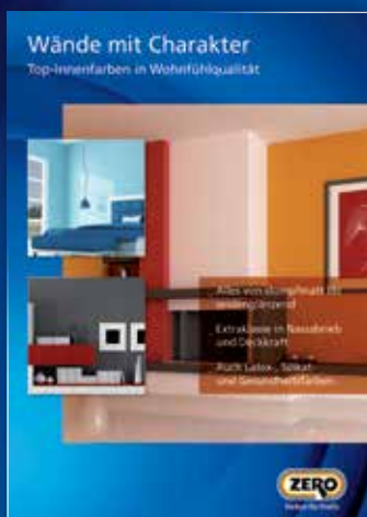
High-performance paints for walls and ceilings – to suit all requirements