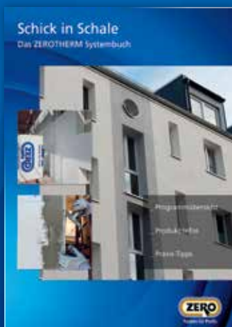
The ZERO THERM System for efficient exterior insulation