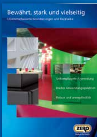
Classic coating systems offering impressive performance