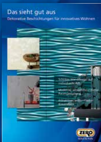
Decorative dimensional coatings for stylish wall design