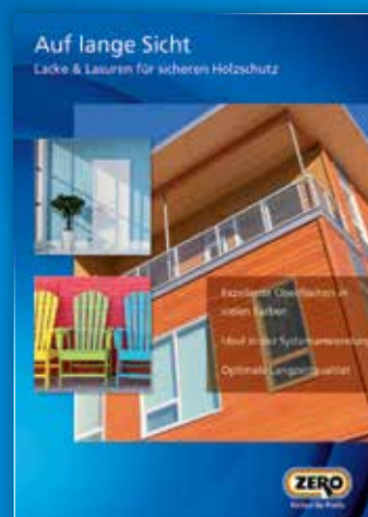
Varnishes & glazes for safe wood protection in a wide range of colours