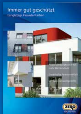
Long-lasting exterior paints – colourful and environmentally friendly