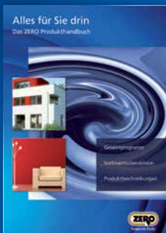
The entire product range as a clearly laid-out product catalogue